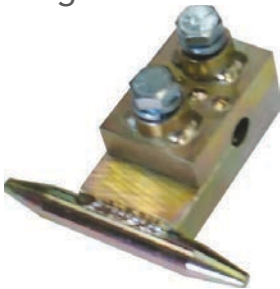
Part # 16.0600.00

Conveniently clamp on rod before driving rod into ground.