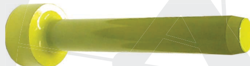
Part # 16.0700.00

Place Adapter Pin on clamp and begin to drive rod. Re-position Adapter Pin on top of rod and continue to pound rod into the ground.